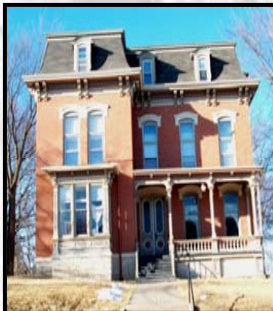
Italianate mixed with Second Empire

A popular style in the second half of the nineteenth century, also known as the High Victorian Italianate. The style draws on Romanticized image of the Italian rural villa as popularized by the pattern books of American architect Andrew Jackson Downing, which circulated during the 1830s and 1840s and beyond. In Dubuque elements of the Italianate frequently mix with features of other styles, notably the Second Empire, creating a hybrid Italianate that conforms to the basic characteristics with a few unusual additions. Typical features include a tall, box-like mass with a hipped or Mansard roof, prominent eaves or cornice with large decorative brackets, windows and doors with extremely tall, narrow proportions and arched or rounded heads, decorative window hoods, elaborate porch detailing with attenuated proportions, and often a cupola or tower.