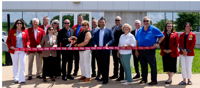
The City held a ribbon-cutting and open house to celebrate the completion of the new Tier 3 data center on Tuesday, July 15.

& New Location for City's Information Technology Department