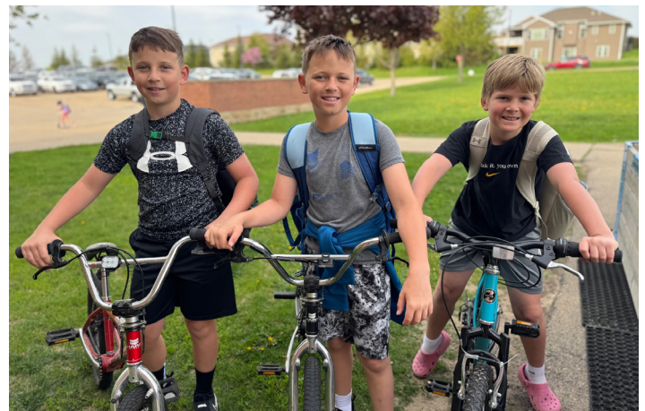
Carver Elementary School students on Walk, Bike, and Roll to School Day in May 2025.