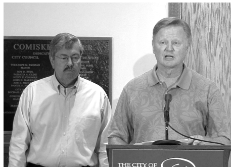
Iowa Gov. Terry Branstad toured storm damage in Dubuque with Mayor Roy D. Buol on July 28 and held a media conference on the devastation. Branstad issued a disaster declaration for Dubuque County on Aug. 2.

255 requests for basement pumpouts were received. Also, the leisure services department tree crew responded to numerous reports of downed trees.