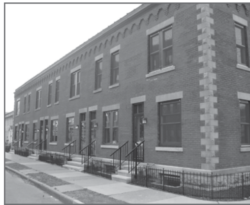
Front view of "row house" town homes

The City of Dubuque Housing and Community Development Department is selling four single-family town homes in the Historic Washington Neighborhood at 1767-1795