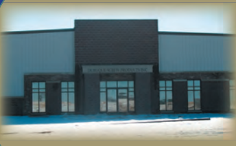
Dubuque Screw Products