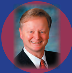
Roy D. Buol Mayor