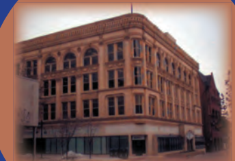
Cottingham & Butler Building