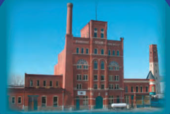
Dubuque Star Brewery