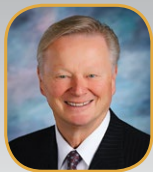
ROY D. BUOL MAYOR