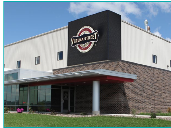
ROASTING SOLUTIONS / VERENA STREET COFFEE

Heartland Financial USA, Inc. is a multi-bank holding company with community banks in Iowa, Illinois, Wisconsin, New Mexico, Arizona, Montana, Colorado, Minnesota, Kansas, and California, with a total of 121 banking locations serving 88 communities. Heartland Financial is headquartered at 1398 Central Avenue and currently employs 350 individuals in Dubuque. In 2012, the company expanded employment and leased a floor in the Roshek Building. Thanks to growth and acquisitions, Heartland is expanding again and will lease an additional floor of the Roshek Building to facilitate that growth. The company plans to spend approximately $1.2 million for remodeling and $860,000 in equipment, software, and furnishings to accommodate at least 31 new employees. In September 2017, the Iowa Economic Development Authority board approved an $80,000 forgivable loan and more than $120,000 in tax credits to Heartland through the State's High Quality Jobs Program to support this expansion. Under the terms of the state incentives, 20 of the new workers must be paid at least $22.37 per hour. A $150,000 loan from the East Central Intergovernmental Association serves as the local match and $1.8 million in financing by Heartland will complete the funding of the project. ♦