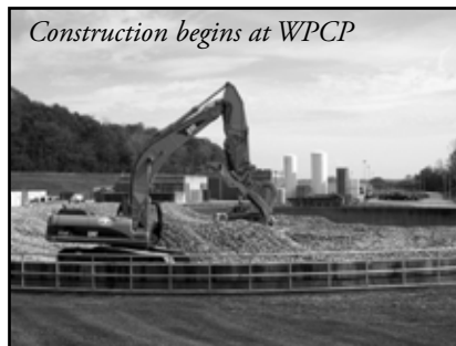
Construction begins at WPCP

The City's Water Pollution Control Plant (WPCP) treatment facilities on Julien Dubuque Drive were designed and built over 40 years ago. Construction of the new WPCP facilities requires four major components: four anaerobic digesters (each approximately 70 feet in diameter and 30 feet tall) and a central control building; conversion from chlorine disinfection to ultra violet light; modification of existing structures for flow equalization; and overall upgrades and repairs. A small structure will also be constructed to temporarily store bio-solids before they are transported to an off-site storage facility and ultimately applied to agricultural