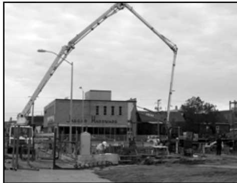
10th & Central Parking Ramp Construction

The City of Dubuque's Parking Division has long maintained a waiting list for parking spots at most downtown ramps. To address current and future needs, a 477-space, seven-level ramp is being built at 10th Street and Central Avenue. The project also includes the addition of three truck bays to the Fire Department headquarters next door.