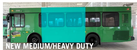
NEW MEDIUM/HEAVY DUTY