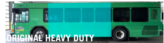
ORIGINAL HEAVY DUTY