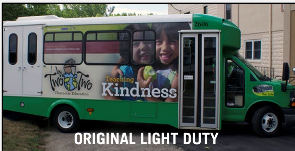
ORIGINAL LIGHT DUTY

Exterior ad space options and pricing are listed on page 2.