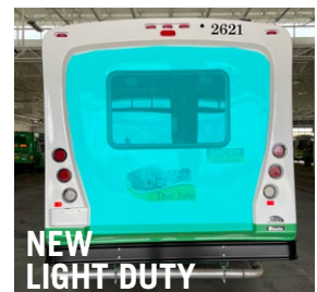
NEW LIGHT DUTY