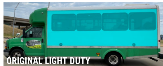
ORIGINAL LIGHT DUTY

Design templates (Adobe Illustrator and Photoshop) are available for download from the Jule's website. The customer is responsible for ad design. Production of the ad is completed locally by McCullough Creative, Inc.