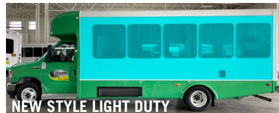
NEW STYLE LIGHT DUTY