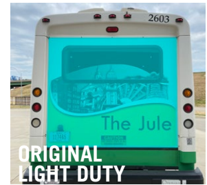
ORIGINAL LIGHT DUTY