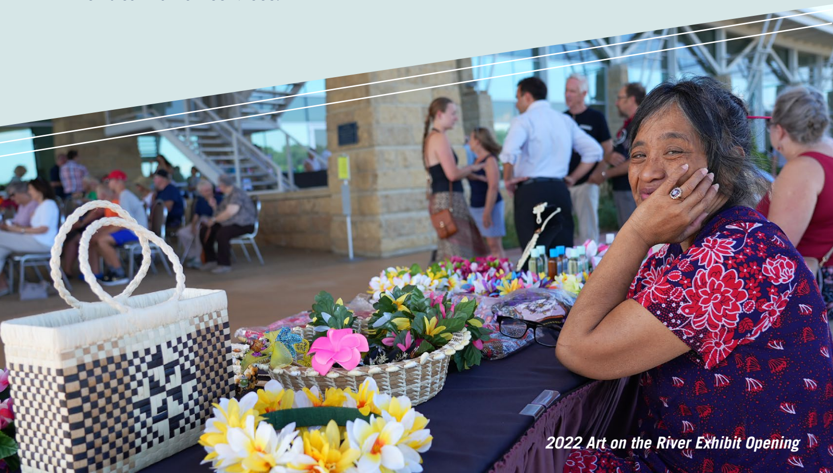
2022 Art on the River Exhibit Opening

Dubuque city government is progressive and financially sound with residents receiving value for their tax dollars and achieving goals through partnerships. Dubuque city government's mission is to deliver excellent municipal services that support urban living; contribute to an equitable, sustainable city; plan for the community's future; and facilitate access to critical human services.