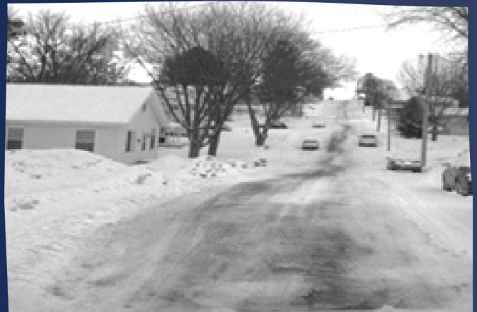
PLOWED, TREATED WITH SNOWPACK