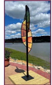
Pluma Sculptura, aka "The Feather"