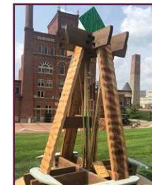
We Are All Downstream