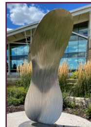
The Single Twist