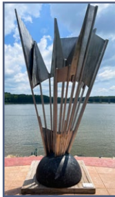
5 Stainless River Marker Skip Willits - Camanche, IA Purchase price: $7,000

The form is generated from starlight, the materials from stardust, and the shiny stainless steel creates scintillating reflections from our nearest star, the sun. FROM_ORION is a bright sculpture generated from star data, mathematically transformed into a sculpture about a tiny place in a vast universe. A shape that is an accurate three dimensional map of the constellation Orion...pointing directly towards earth.