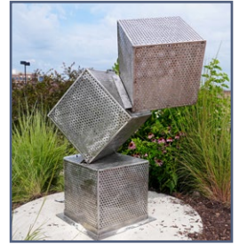
9 Serpentine Insect Hostel Tim Adams - Webster City, IA Purchase price: $7,000

The Gleaming Cube was created to represent a single cube moving in an upward and spiraling motion. The illuminate part is less subtle with The Gleaming Cube . It is shiny stainless steel, so it catches the glimmer of the sun, moon, and electrical light sources on its own. Each of the three cubes contain its own color changing LED light that cycles through blue, green, yellow, red, and purple lights.