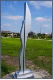
1 Cosmic Slot Bilhenry Walker - Eau Claire, WI Purchase price: $45,000

The interior has a cobalt-blue sliver of light separating the two basic elements. This creates tension between the elements and reveals an inner life that crackles with energy.