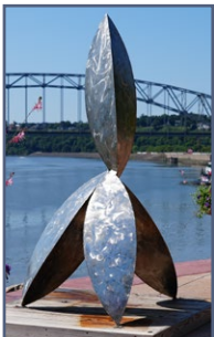
6 Oxbow Reimagined Tim Adams - Webster City, IA Purchase price: $7,000

The finished surface of this stainless steel sculpture reflects the natural light as if illuminated from within, acting as a symbolic beacon, a marker on the road to a sustainable and resilient future. Through its geomorphic pod-like features, it comes to represent the dazzling light of a dynamic community.