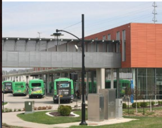
Intermodal Transportation Center | 950 Elm St. Transportation Services (Transit and Parking)