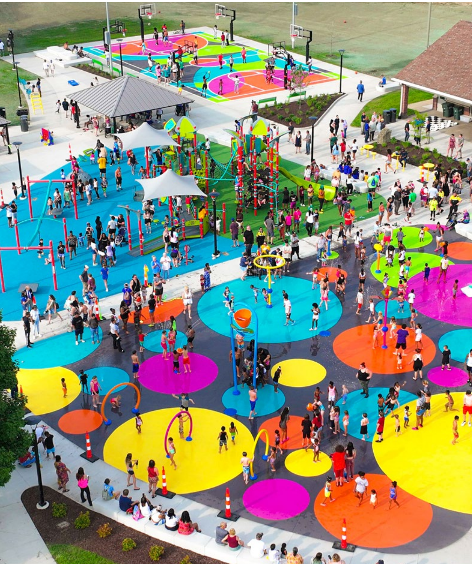
COMISKEY PARK & SPLASH PAD