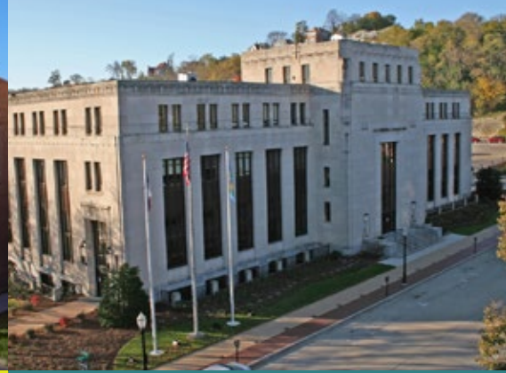
Historic Federal Building | 350 W. Sixth St. City Council Meetings • Housing and Community Development & Inspection and Construction Services