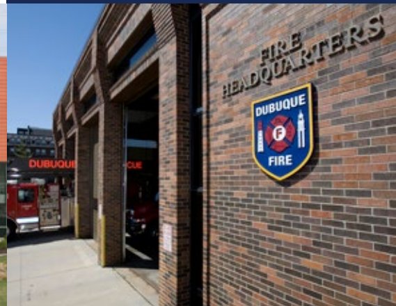
Fire Headquarters | 11 W 9th St. Fire, Rescue, & EMS