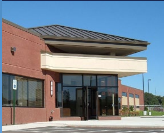
Municipal Services Center | 925 Kerper Ct. Public Works • Water Distribution