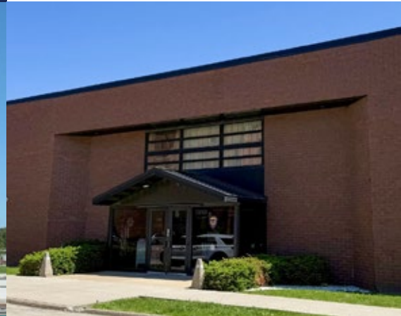
Dubuque Law Enforcement Center | 770 Iowa St. Police