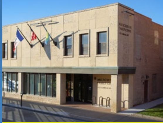
Ruby Sutton Building | 1157 Central Ave. Community Impact • Human Rights Multicultural Family Center Parks & Recreation