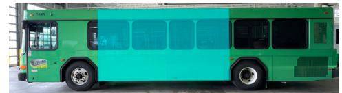
HEAVY DUTY (FIXED ROUTE)