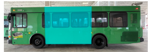
MEDIUM/HEAVY DUTY (FIXED ROUTE)